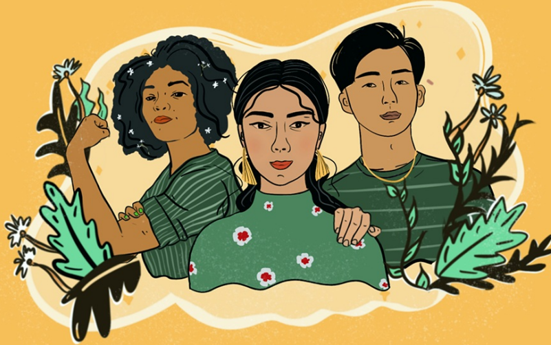
Illustration by Jamie Chin via SolidarityStories.org