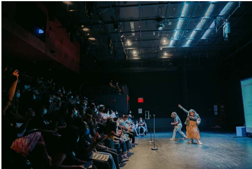
Staging the Revolution 2022

Congratulations to GBH Programs and Education teams, including all GBH Teaching Artists and participants, and all staff for putting on an awe-inspiring and energetic show at 5 Angels Theater, Manhattan on Saturday, June 4th! If you missed it, watch the recording here .